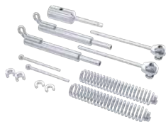
SUS 3 starter set