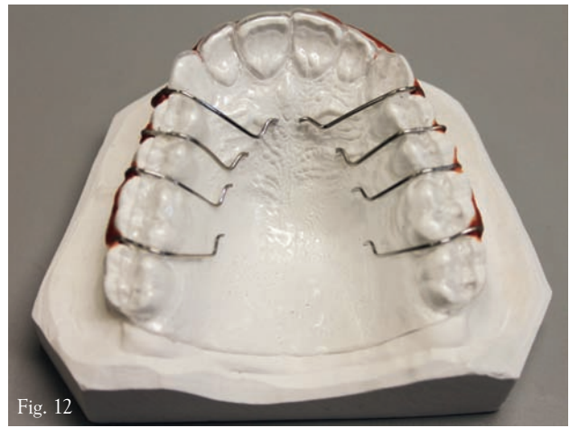
FIg. 12: The clamps rest directly on LAMIoneFig. 13: Fixating the screw in a drilled holeFig. 14: Fixating the clamps with permanently plastic siliconeFig. 15: Enclosing the screw with cold-curing polymer ...Fig. 16: ... and curing