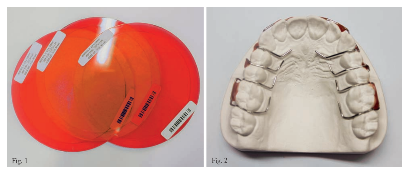
Fig. 1: Biocryl foils are available in different colors and designs Fig. 2: Fixating the elements to the model in the Biocryl technique

difficult. In addition, the risk of changes in dimension and fit during thermo treatment at 100 ^{\circ}C/212^{\circ} F is relatively high, even if the appliance rests on the model during the procedure.