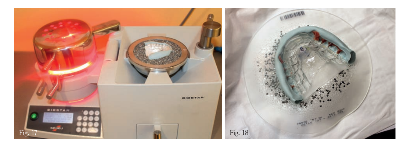
Fig. 17: Pressing LAMItwo with the soft side onto the model L11 Fig. 18: Easy removing from the model, the clamps are fixed tight

spindle, some cold-curing polymer has to be added around the screw (Fig. 15) and be polymerized in the pressure pot (Fig. 16). The model has to be blowdried so that the LAMIone foil can be processed with the LAMIbond bonding agent. Next, the second foil (LAMItwo; 1.8 mm PC/PU) has to be pressed tightly (Fig. 17) onto the first foil so that