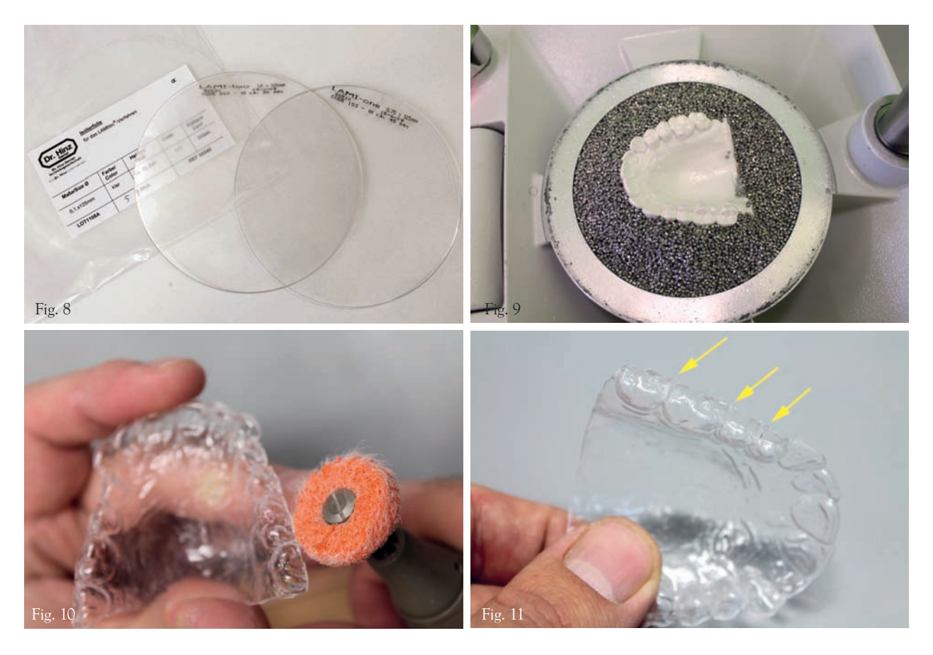
Fig. 8: The LAMItec foils

A completely PMMA free alternative is the LAMItec technique (Hinz-Dental, Herne, Germany). This technique involves two foils made of polycarbonate (PC) and soft polyurethane (PU) (Fig. 8). The system